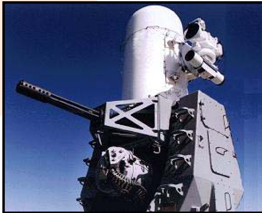
PHALANX Mark 15 Close-In Weapons System (CIWS)

As part of the US Navy response to the proliferation of ASM technology and capabilities, a Ship Self Defense System (SSDS) program was initiated in the early 1970's. The first system developed as the "final line of defense" against anti-ship missiles was delivered by General Dynamics to the US Navy and installed for evaluation purposes on the USS King in 1973. The weapons system was the PHALANX Mark 15 Close-In Weapons System (CIWS) pronounced "see-whiz". The basis of the technology