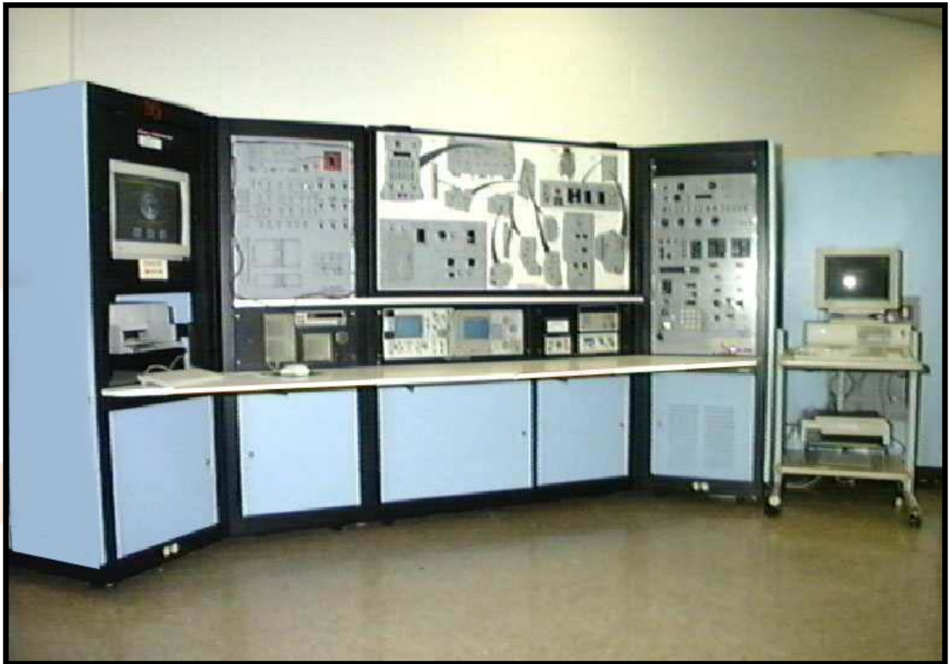
Close-In Weapons System – Maintenance Trainer (CIWS-MT), Training Device 11G2

30 years. As the system has evolved - in terms of mission parameters, weapons effects, target acquisition, etc - and in order to track these variants of the CIWS – configuration changes became known as “BLOCK”, or versions of the system. The CIWS can automatically search, detect, track, engage and confirm kills using its computer controlled