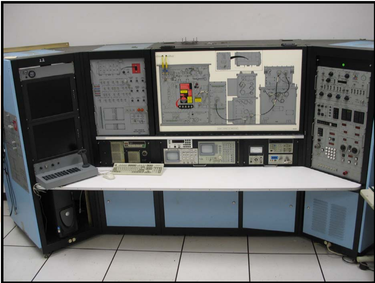
CIWS-MT, Training Device 11G2 with latest BLOCK 1B Upgrade

appear in the Fleet, there will be a significant impact to student throughput as SIMLAB time will have to be restructured or other mounts procured and upgraded. Without the upgraded mounts to support the lack of upgraded 11G2s, there would be some maintenance personnel who may not have had an opportunity to conduct maintenance